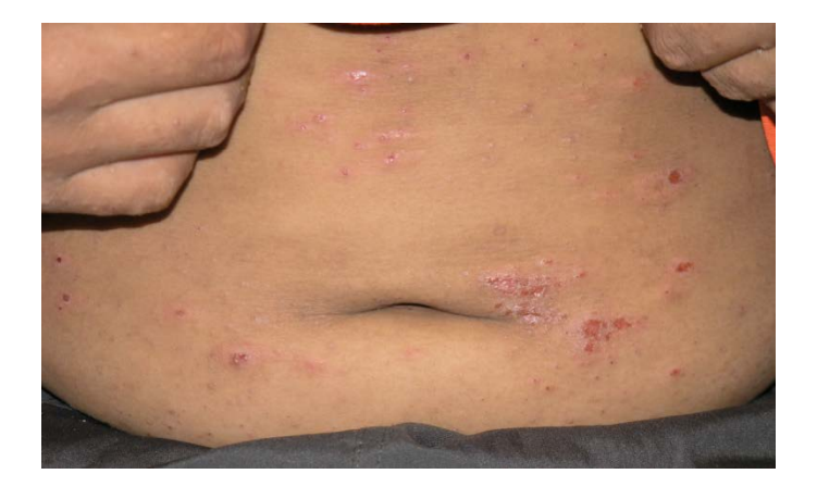
Scabies infection presenting on abdomen