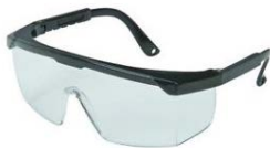
Sample trauma glasses