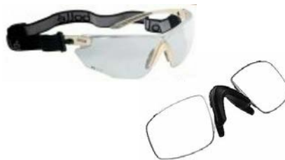
Bolle 40168 or similar frame type Compatible with Rx inserts Sample shown with removable neck strap