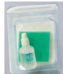
Anti-Fog Solution & Sponge PMM 2 # 23144