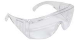
Can be used as OTG 'over the glasses' PMM 2 # 588519