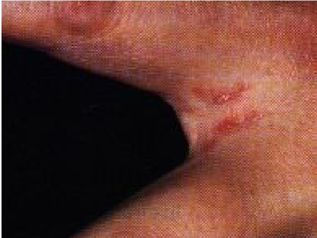
Scabies infection in webs of fingers