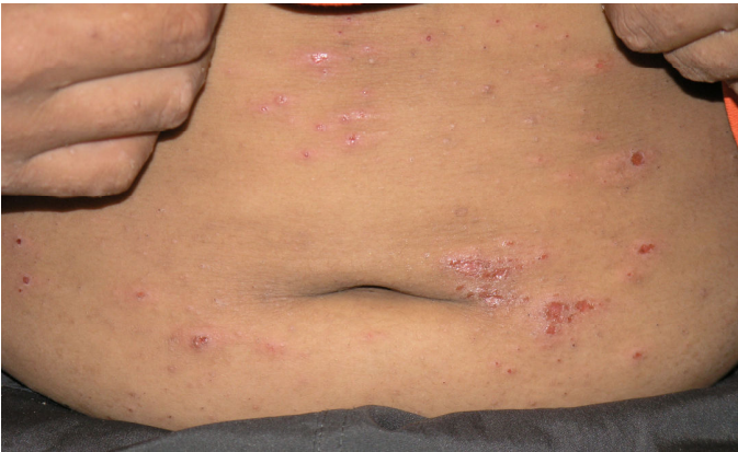
Scabies infection presenting on abdomen